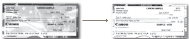
Fine Text Filtering

The Fine Text Filtering Function removes backgrounds and other unnecessary noise, allowing focus on the text, resulting in a clearer and more accurate scan.