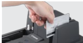
Magnetic Swipe Reader (Option)