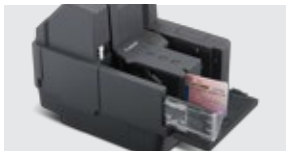
Card-reading slot (Standard equipped)

*Requires the optional Magnetic Swipe Reader Unit.